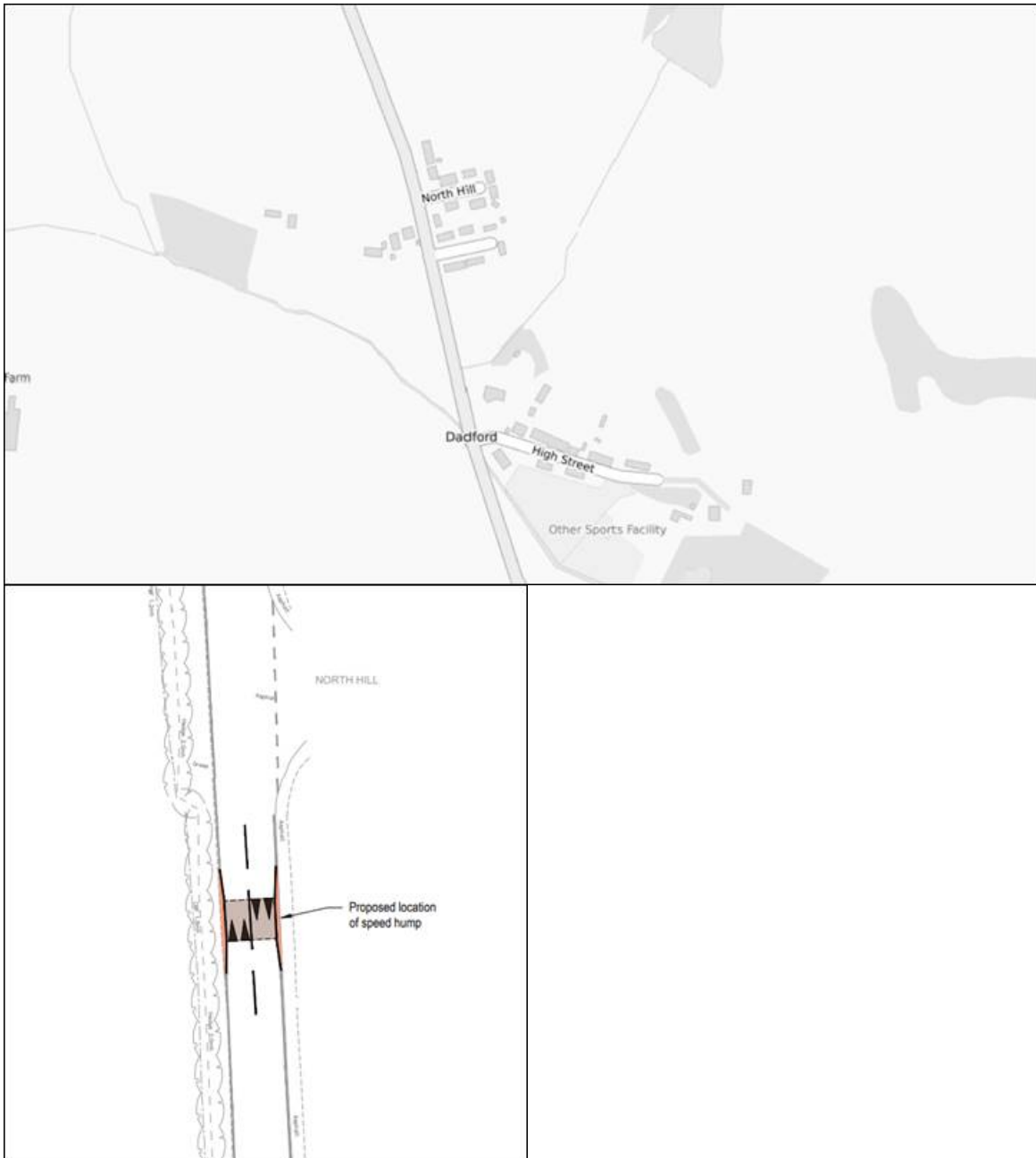
Figure 1 Dadford collision history location